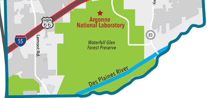
Community downtowns are listed on the community maps